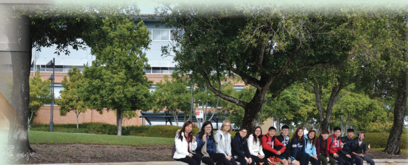
Griffith UNIVERSITY Logan Campus